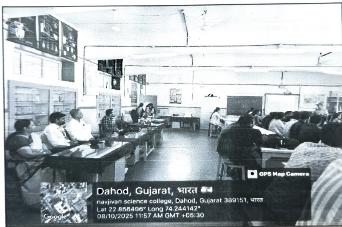
Awareness Seminar – “Wildlife Conservation and Sustainable Living”

The final day of the Wildlife Week Celebration concluded with an Awareness Seminar on the topic ‘Wildlife Conservation and Sustainable Living’. The seminar emphasized the importance of protecting wildlife habitats, reducing human impact, and promoting eco-friendly lifestyles. Speakers highlighted the role of youth in conservation and the global challenges faced by wildlife due to urbanization and climate change. Students actively participated in discussions and shared their views on practical ways to contribute towards conservation efforts. The seminar inspired everyone to adopt a more responsible attitude towards nature.